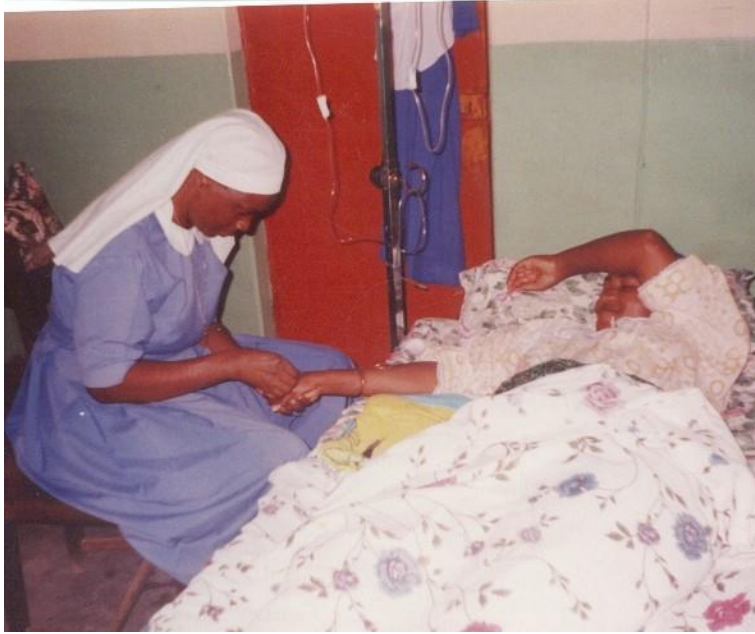
Kipalapala Clinic – Tabora

Many times, women are forced to share a bed after delivering their babies because of the shortage of beds. To meet the needs of mother and child who need our care, love and support, the Sisters need to purchase hospital delivery beds and delivery kits that can be used in the rural areas.