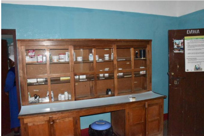
Ussongo Clinic – Singida – Medicine Cabinet