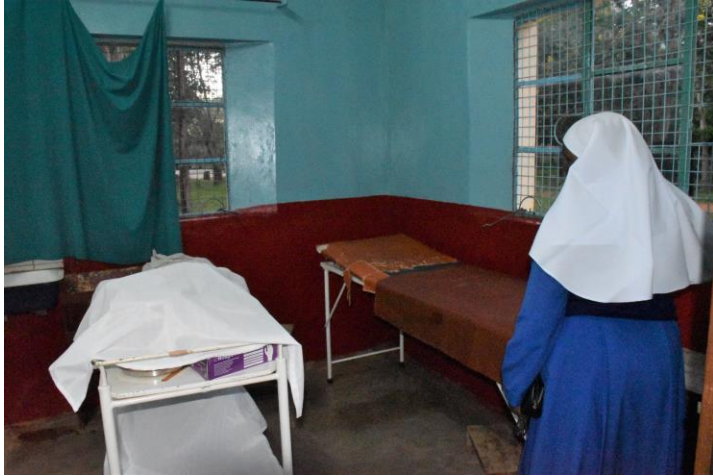
Ussongo Clinic – Singida – Patient Room Equipment