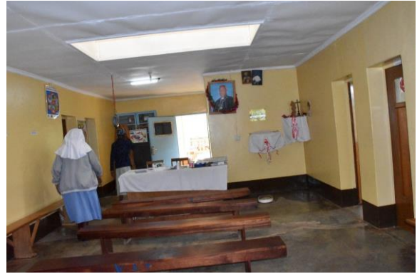
Mbulu Health Center Waiting Room - Tlawi