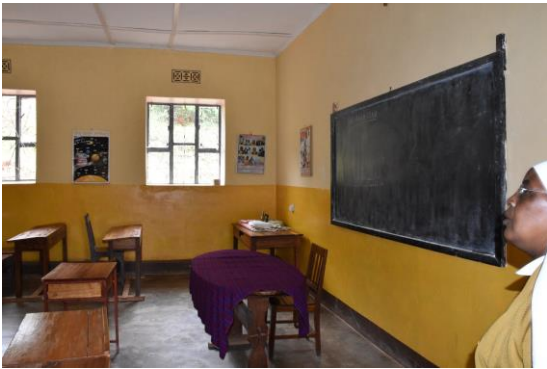
Mbulu Health Center Classroom – Tlawi