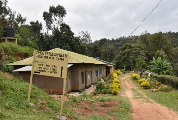
Mbulu Health Center – Tlawi