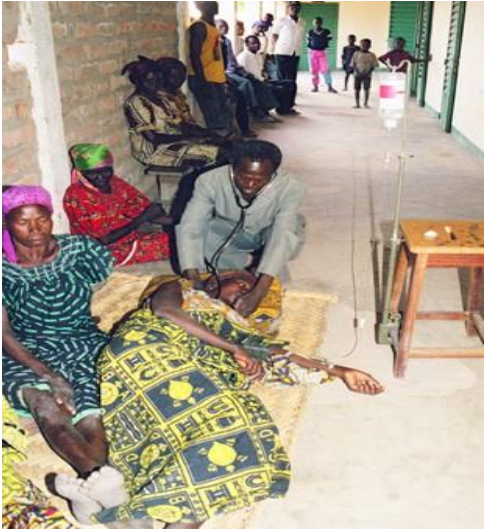
Kipalapala Clinic – Tabora