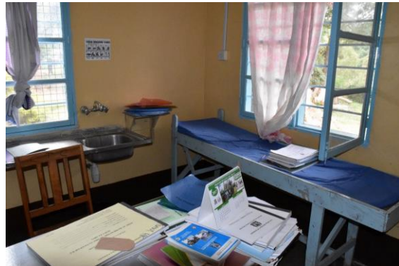
Mbulu Health Center Patient Room - Tlawi

Your financial support is highly appreciated to enable the Sisters to effectively meet the needs of Mother and Child. Thank you for your prayers so that the work the Sisters do will continue to show the great love of God to those we serve. And thank you for supporting their missions in Tanzania. God bless you all.