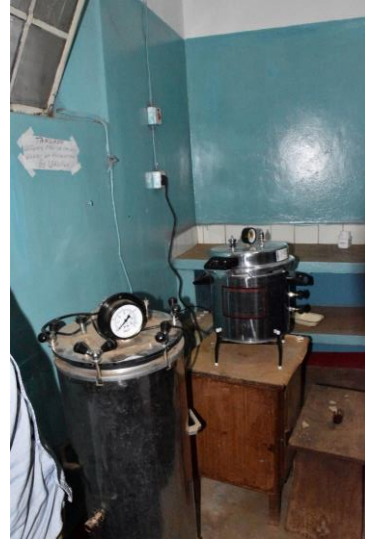
Ussongo Clinic Sterilization