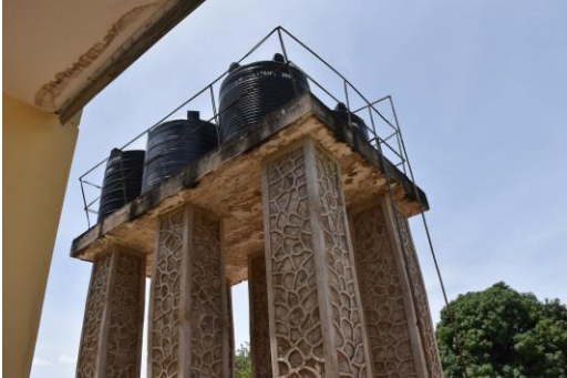
Water Supply for Kipalapala Clinic – Tabora