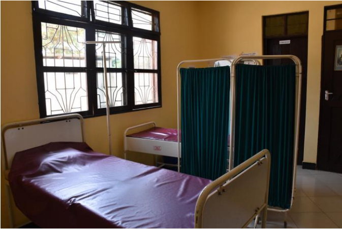
Patient beds at Kipalapala Clinic – Tabora